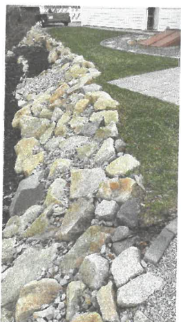
Picture current RipRap Boulder Wall