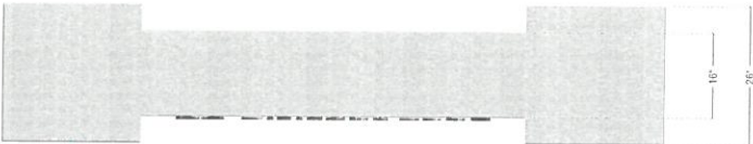
3 Plan View Scale: 1:4 Fabrication