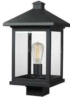
Z-Lite 1 Light Post Mount Light in Black Finish