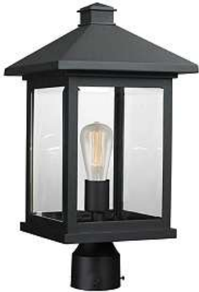
Z-Lite 1 Light Post Mount Light in Black Finish