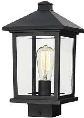
Z-Lite 1 Light Post Mount Light in Black Finish